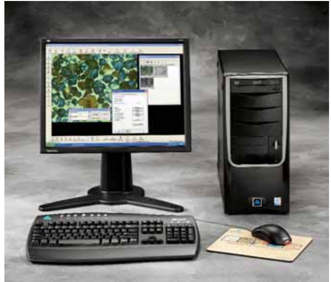
OmniMet® Modular Imaging Platform

Take your thin section analysis to the next level with a Buehler OmniMet® Image analysis system. Choose from a basic image capture system to a full blown image analysis