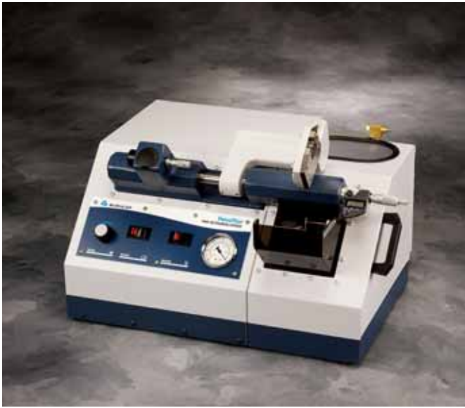
38-1450 PetroThin® Thin Sectioning System allows for the re-sectioning and grinding of rocks or minerals, ceramics and geological specimens in one machine. Grind to a thickness of ~100µm.